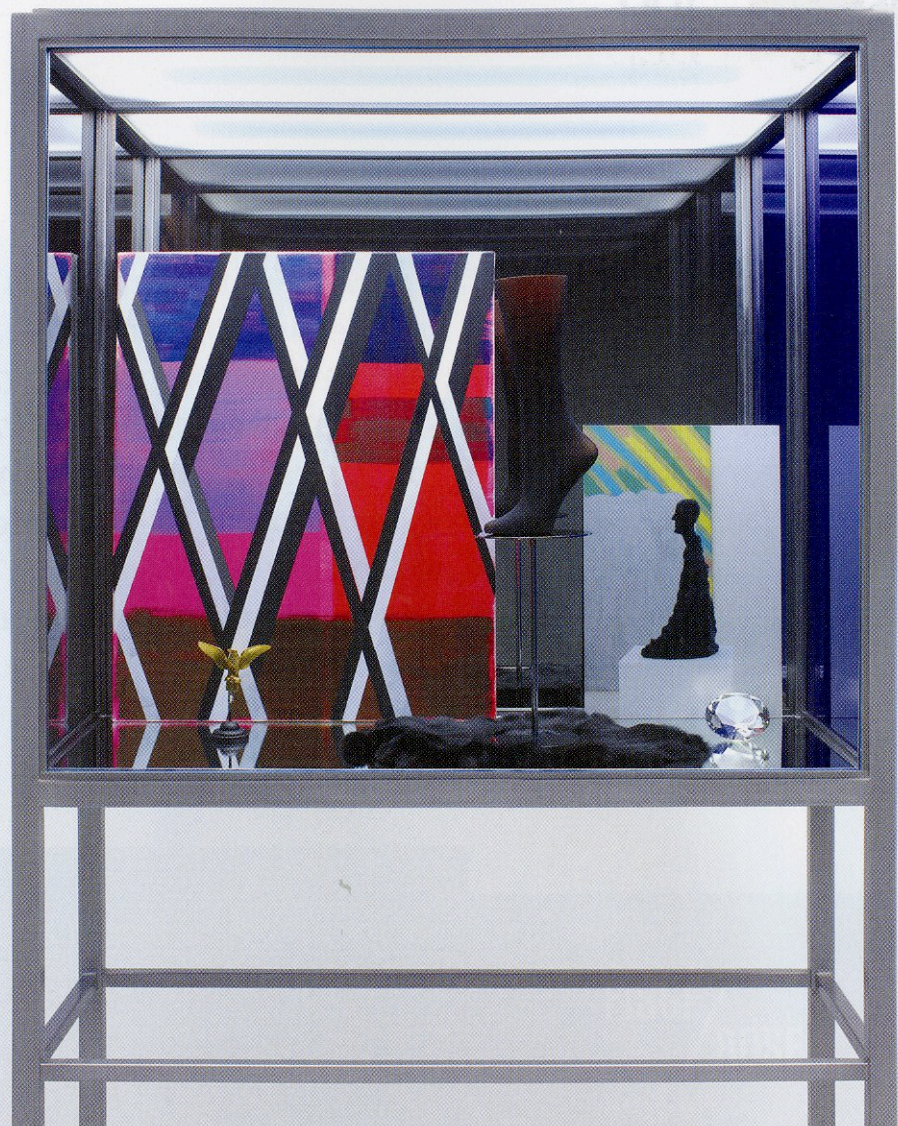
ABOVE: Josephine Meckseper Emirates Palace , 2011. Mixed media in glass vitrine with fluorescent lighting, 80 x 47 x 20 in.

Tobias Rehberger PILAR CORRIAS GALLERY November 18–December 21 LONDON